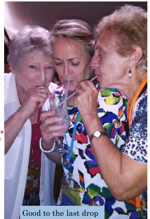
Good to the last drop